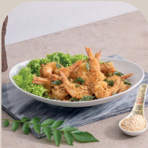
CRISPY CEREAL DESHELLED PRAWN 麦片虾球 (S) RM40 (M) RM75 (L) RM110