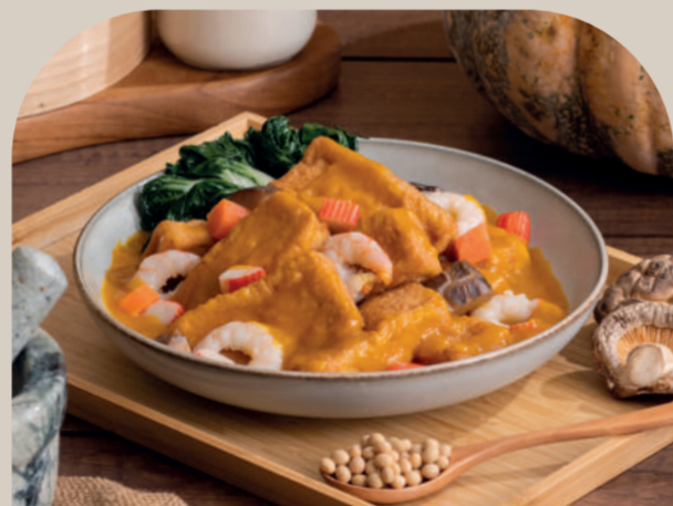
GOLDEN BEANCURD WITH PUMPKIN SAUCE 黄金豆腐 (S) RM26 (M) RM38 (L) RM50