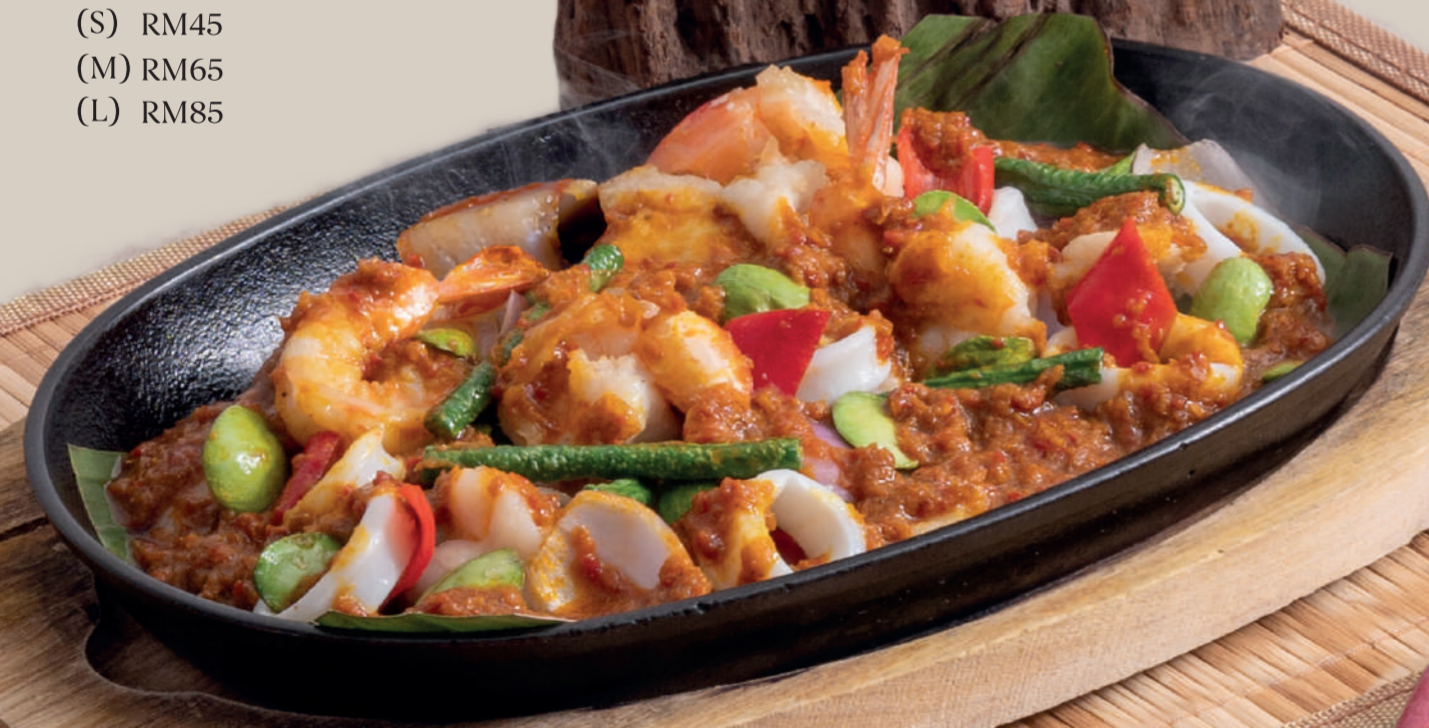
KAPITAN STYLE MIXED SEAFOOD 甲必丹三鲜 (S) RM45 (M) RM65 (L) RM85