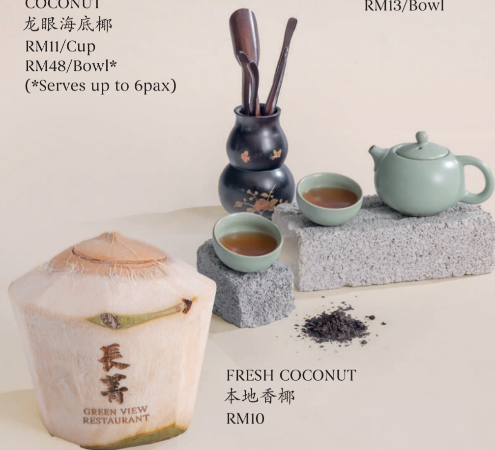
FRESH COCONUT 本地香椰 RM10