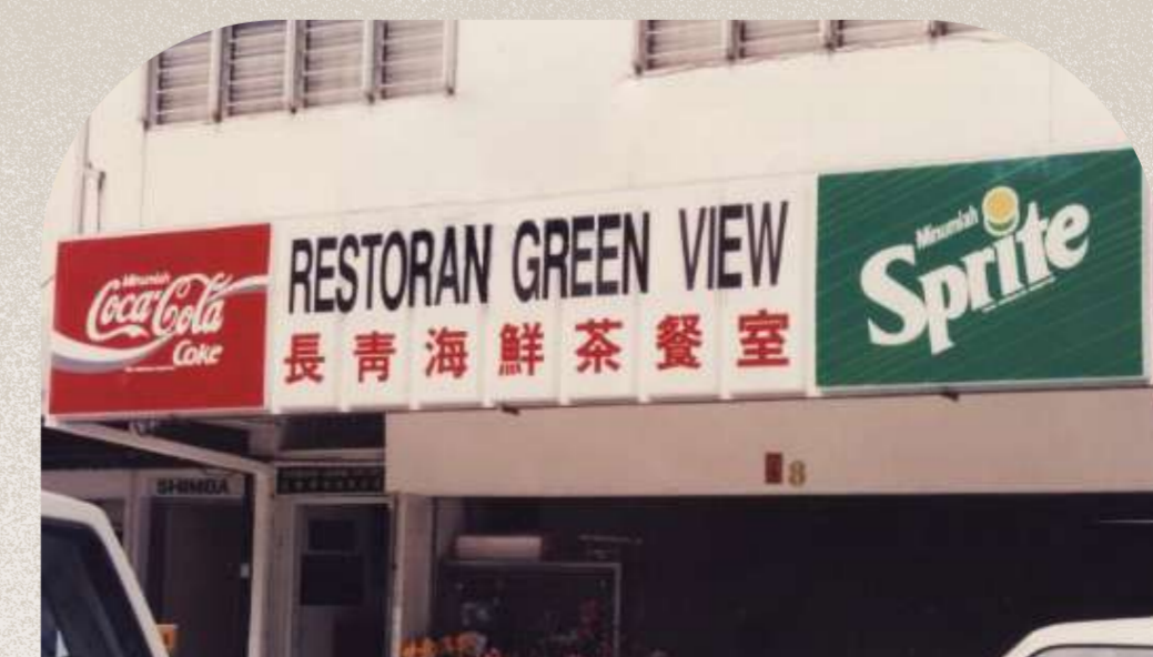
Where we began in 1993

1993年创业至今，長菁的经典味道一路传承了30余年之久。坚持选用优质食材，不断提升烹饪水准。我们相信用心料理，服务至上，方能永续经营，成为顾客首选的海鲜饭店。