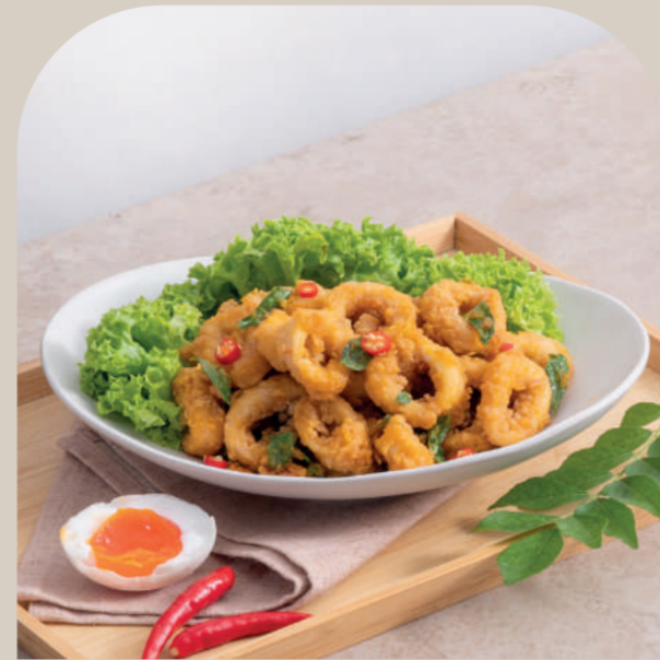
SALTED EGG FRIED SOTONG 咸蛋苏东 (S) RM40 (M) RM55 (L) RM70