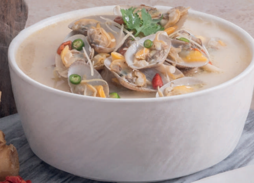
POACHED SEA CLAMS IN HOT PEPPER SOUP 爆炸啦啦汤 (S) RM28 (M) RM40 (L) RM52