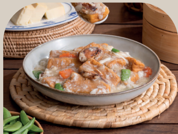
BRAISED BEANCURD WITH CRAB MEAT 蟹扒豆腐 (S) RM32 (M) RM47 (L) RM62