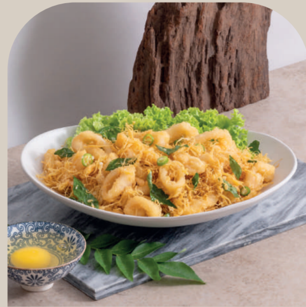
DRIED BUTTER FRIED SOTONG 干奶油苏东 (S) RM40 (M) RM55 (L) RM70