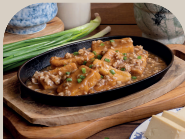
SIZZLING HOT PLATE BEANCURD 铁板豆腐 (S) RM26 (M) RM38 (L) RM50