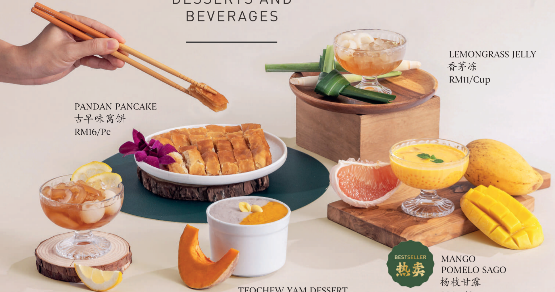
PANDAN PANCAKE 古早味窝饼 RM16/Pc